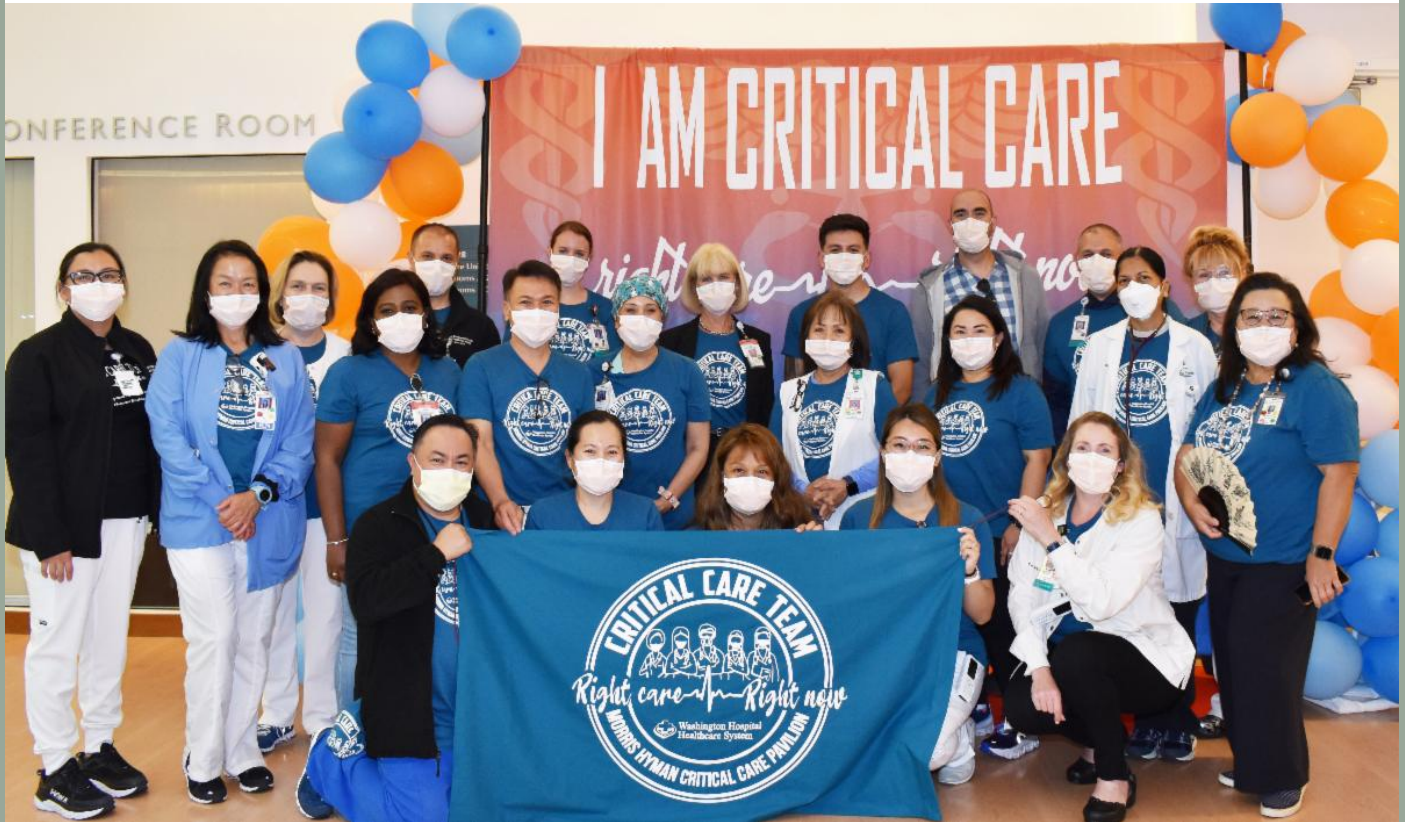
Photo: Washington Hospital's Critical Care Team celebrates Critical Care Awareness week in 2022, recognizing the commitment of critical care clinicians and staff to providing high quality patient care at Washington Hospital

Furthering the Mission of Washington Hospital Healthcare System Since 1983