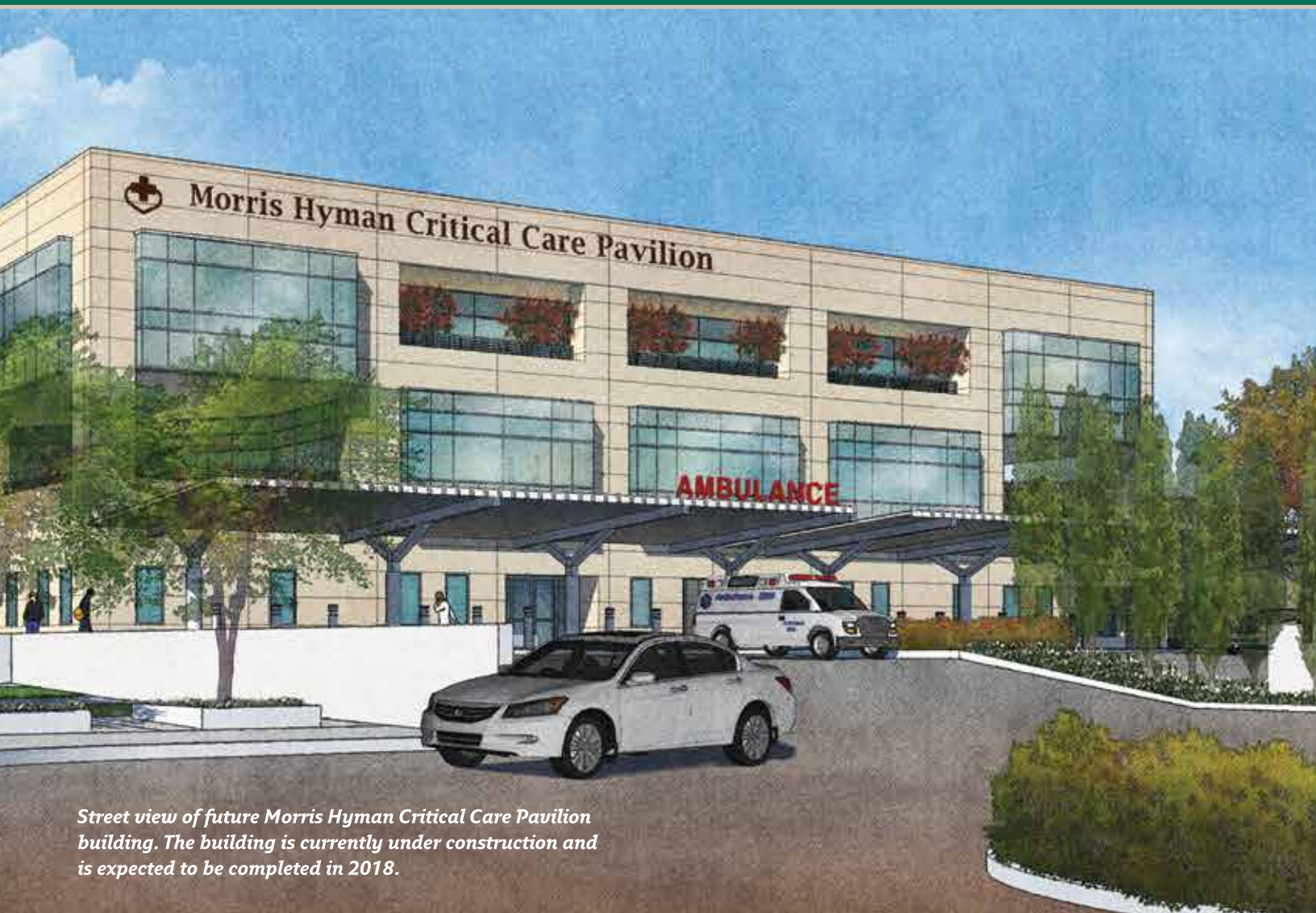
Street view of future Morris Hyman Critical Care Pavilion building. The building is currently under construction and is expected to be completed in 2018.

The ICU and CCU will also be expanded, and there will be an additional 68 private medical/surgical patient beds, as well as more space for support personnel and storage.