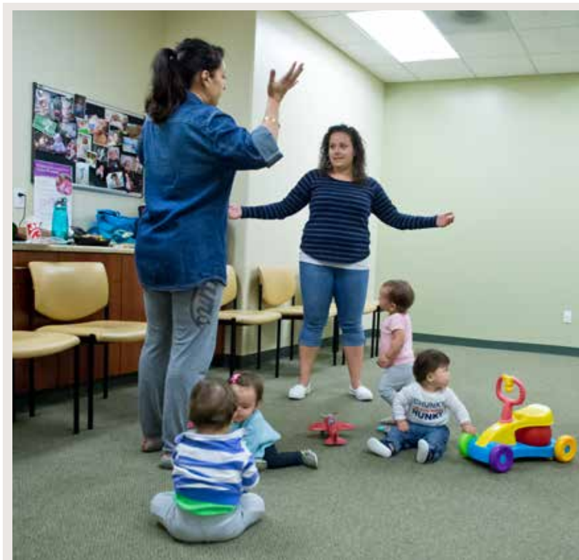
The Crawlers Group meets on Monday, Wednesday and Friday from 11 a.m. to 1 p.m. at Maternal/Child Health Education Center located at 3569 Beacon Avenue, Fremont.

passenger safety technician. During the 30-minute one-on-one session, parents learn how to make sure child safety seats are installed and used correctly.