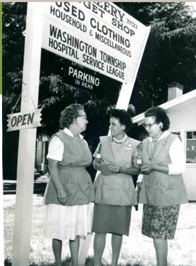
Pink Ladies in front of the Cheery Budget Shop in the mid 1950s. In the beginning, Service League volunteers were known as "pink ladies" because of the pink uniforms they wore. The Cheery Budget Shop, which was located in the Centerville District of Fremont, raised funds for Washington Hospital before the hospital opened its doors in 1958.

Today, as it celebrates six decades of matchless dedication to our Hospital and community, the Service League continues to flourish. The Service League counts more than 600 men and women, including high school