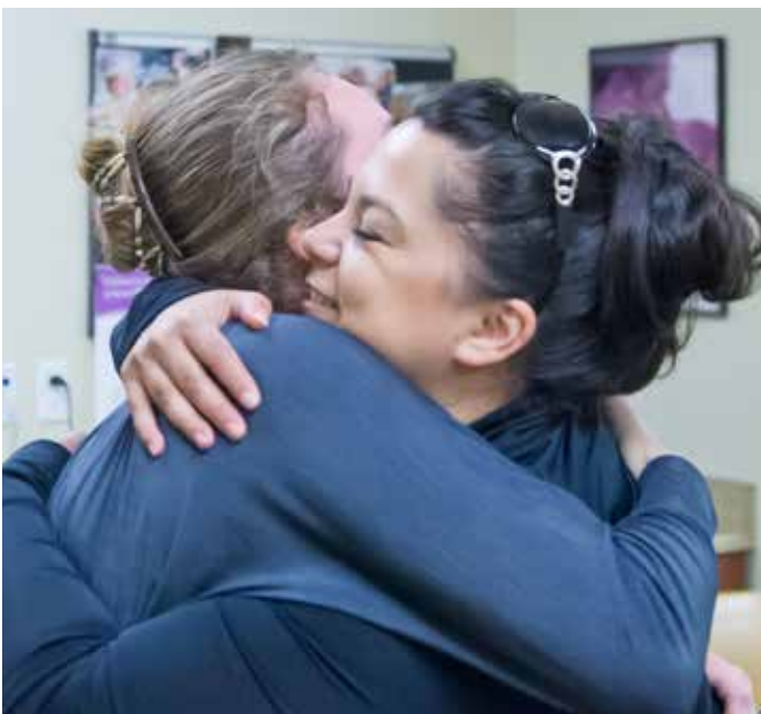
Above: Mom and new crawler enjoying their regular visit to the New Crawler Group at the Washington Maternal Child Education Center. Below: Moms have formed bonds with each other and greatly value their new friendships and support group.

For years, Tri-City mothers have depended on Washington Hospital Healthcare System's free Baby 'n' Me drop-in support group to connect with other local women so they can share the joys and challenges of being a new mom. Held three times weekly at Washington's Maternal/Child Health Education Center on Beacon Street in Fremont, the come-as-you-are group is a great way to help smooth the transition into parenthood while developing lasting relationships for moms and babies. All local mothers and babies are welcome, no matter where the baby was born.