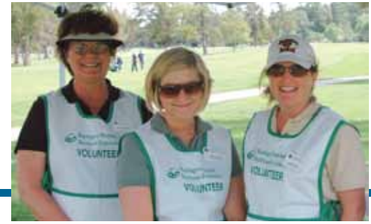
Volunteers from the 24th Annual Golf Tournament