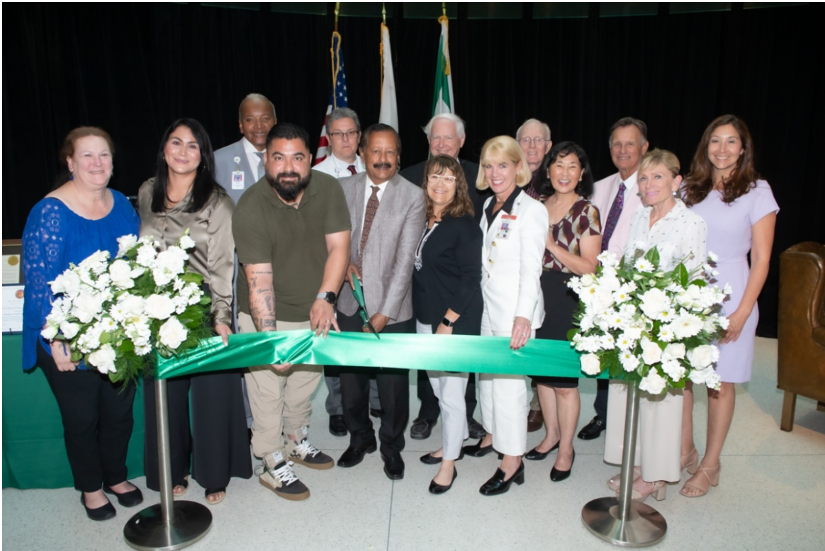
Photo: On June 24, Washington Hospital held a ribbon cutting ceremony to officially open its doors to the provisional Level II Trauma Center, providing lifesaving and life-sustaining care close to home